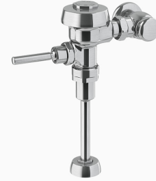
Variation Not Shown: Front of Valve Handle